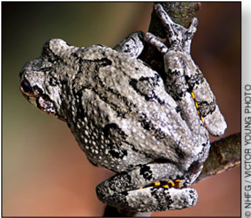
Gray tree frog

New Hampshire has ten native species of frogs. Most of these frogs are what one might expect of frogs in the cool climate found here: they live in or near ponds, they have moist, smooth skin and they hibernate at the bottom of ponds in winter. The gray tree frog, on the other hand, is not what one might expect. It lives in trees, it has bumpy skin and it hibernates in leaf litter on the forest floor. It is more like something one might find in a tropical rain forest.