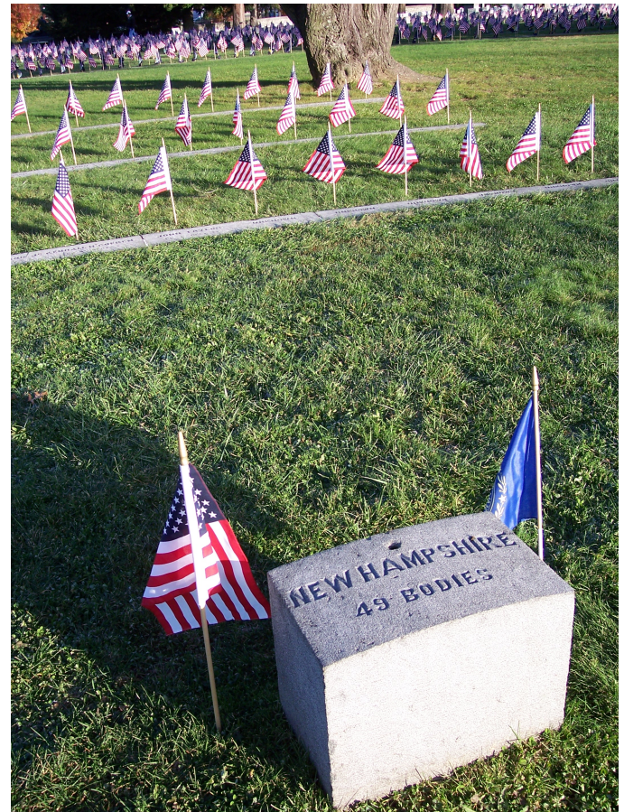
NH graves at Soldiers' Cemetery in Gettysburg